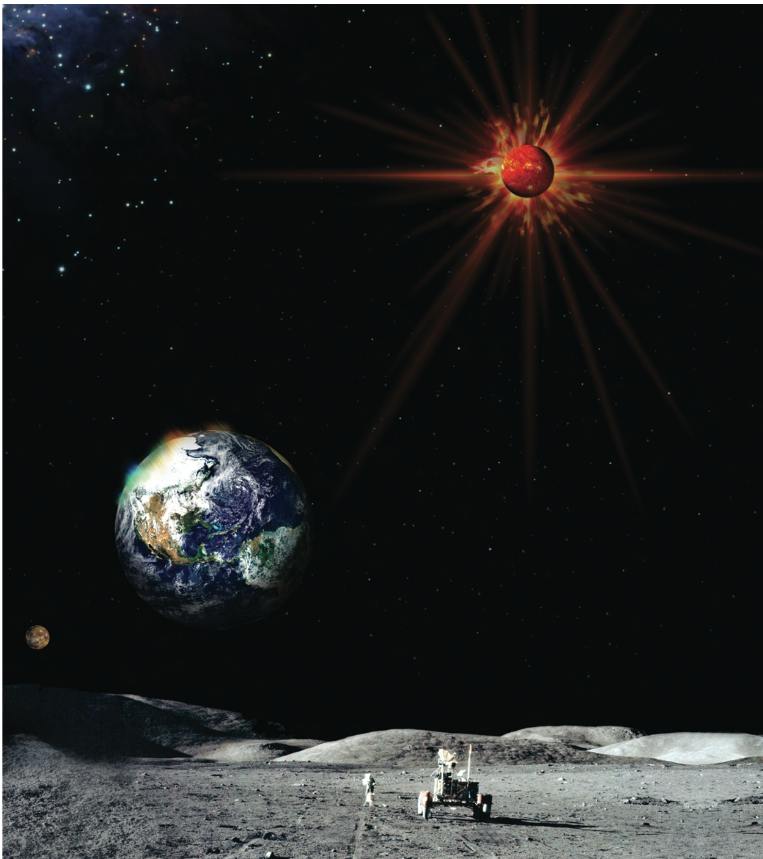
An envisioned astronaut on the surface of Mars, with actual images of the Moon, Earth, and Sun placed in the Martian sky, shown here much larger than they would actually appear from that distance.